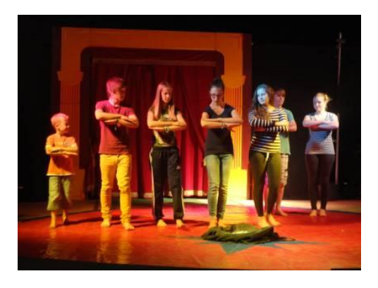
Cord as a Fakir (on the left side)

Jule on her unicle (in blue shirt) and with the ladder (in the middle with pink shirt)