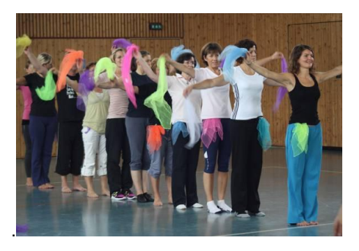
The trainer group with luminous rags

But what does "a circus project" mean? – Has it something to do with diabetes or prevention? NO! It was one of the many highlights of the 150<sup>th</sup> birthday of our hospital foundation. Fun activities marked the celebration with music, cakes, drinks, and a real circus performance by this new young roup of artists! It was an exciting time for these circus amateurs, including me, as their clueless and inexperienced trainer!