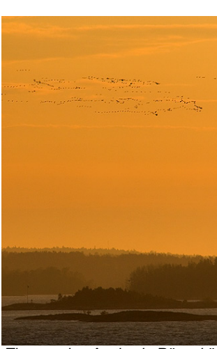
The evening Arctica in Rönnskär

The main activator of the spring Arctica migration is warming of the weather. The cold northerly air flow holds back the migration desires but the southwestern thermal is the moving spirit of massive coveys of birds.