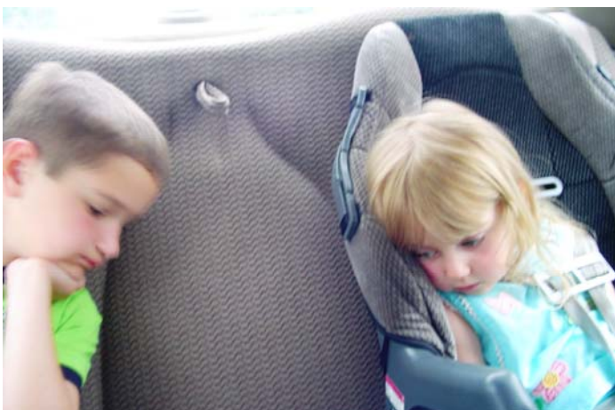
Children watching a movie while traveling.

Vacations can be a wonderful experience for the entire family. Keeping your children entertained during your travels is an important component to a happy vacation. Whether your family is traveling across the country or 100 miles from home, it is important to be safe, have fun and enjoy the experience. Happy travels!