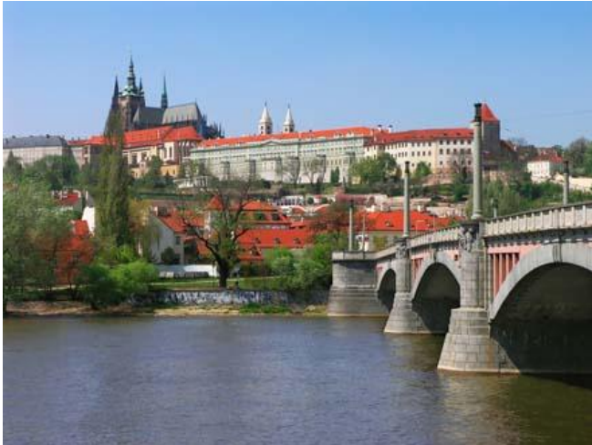
Prague, venue of our national coordinating center

Our country joined the TRIGR study in Spring 2003 with just one study center residing in Prague. After meeting the necessary administrative preparations, our first TRIGR baby was born in August 2003. During the following 2 years, more cooperating teams were searched for throughout the whole country, and six new centers were established mostly in major regional cities, in Brno, Olomouc, Usti nad Labem, Pilsen (Plzen), Ceske Budejovice and Zlin. This allowed us to cover entire country for recruitment purposes and to avoid missing as few eligible families as possible. Even more important, it made the follow-up more convenient for the families already enrolled, especially from the point of view of the distance to the closest study center.